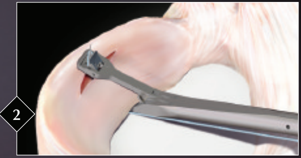
Close the top jaw and squeeze the back trigger to advance suture through the tissue.