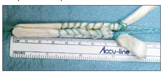
Figure 1. A bovine extensor tendon graft prepared for insertion into a porcine tibia sample.

All samples were fixated with a 9 mm x 28 mm BioComposite Interference Screw.